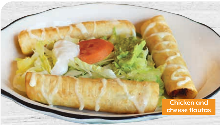
Chicken and cheese flautas