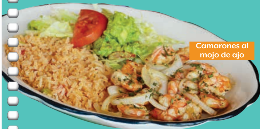
Camarones al mojo de ajo

Grilled shrimp seasoned to perfection, topped with our special cheese sauce, served with Spanish rice, guacamole salad and tortillas.