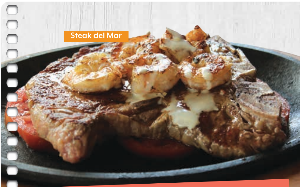
Steak del Mar